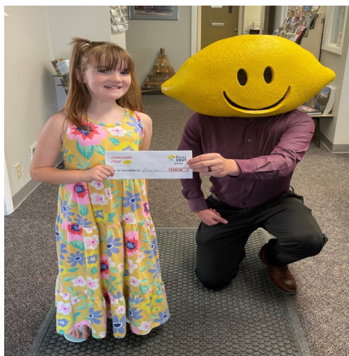
One of our Best of the Zest winners! (above)