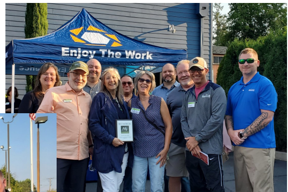
Some New Member Welcomes!