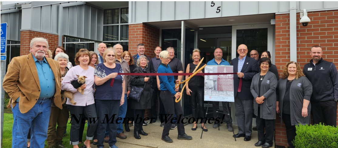
A Ribbon Cutting Celebration! (above)