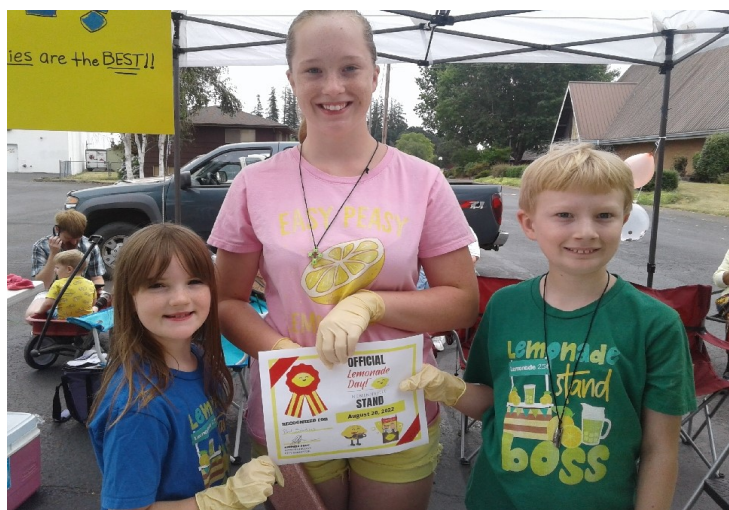
Youth Participants Lemonade Stand recognition! (above)